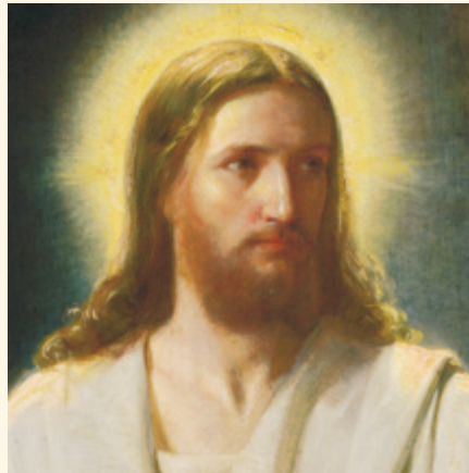
Jesus Christ was the Father's beloved, chosen, and foreordained Son from the beginning.

God created Adam and Eve and joined them as husband and wife, placed them in the Garden of Eden, and commanded them to have children. 26 Exercising their agency,