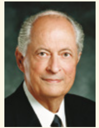
By Elder Robert D. Hales Of the Quorum of the Twelve Apostles

A SACRED TREASURE OF KNOWLEDGE TO GUIDE US