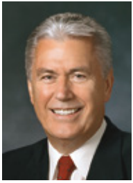
By President Dieter F. Uchtdorf

Second Counselor in the First Presidency