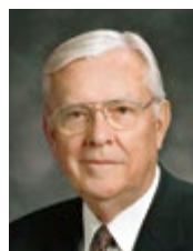
By Elder M. Russell Ballard Of the Quorum of the Twelve Apostles