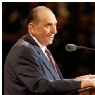
DILIGENCE: PRESIDENT THOMAS S. MONSON

solution. This he did, taking 16 small molten stones to the Lord to ask for something that only the Lord could do. In deep humility, he asked the Lord to “touch [the] stones” (Ether 3:4). The brother of Jared then saw the premortal Savior “because of [his] faith.” The Lord told him, “Never has man come before me with such exceeding faith as thou hast” (Ether 3:9).