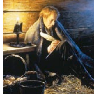
PATIENCE: JOSEPH SMITH