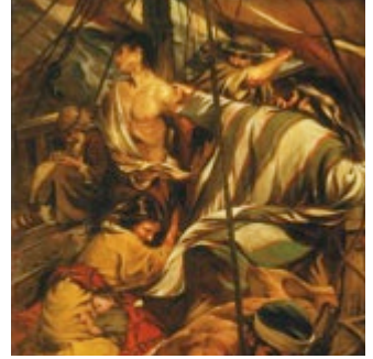
BROTHERLY KINDNESS: NEPHI

Thinking about an individual who managed to develop a divine attribute in his or her life provides a powerful example that may assist us in our efforts to do the same. Consider, for example, the attributes associated with the prophets above.