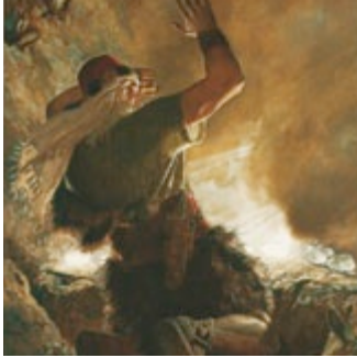
FAITH: THE BROTHER OF JARED