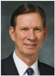
By Elder Craig A. Cardon Of the Seventy