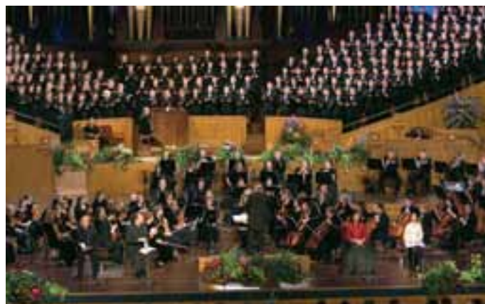
The Orchestra at Temple Square, shown here performing with the Tabernacle Choir, celebrates its 10th anniversary in 2009.

“The Liahona will continue to amplify the prophetic voice of the Brethren to the Saints around the world,” said Elder Spencer J. Condie, editor of the Church magazines. “We hope that the Liahona will be found in every Latter-day Saint home throughout the earth.” ■