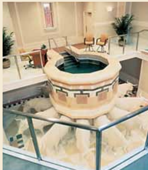
LEFT: PHOTOGRAPH OF BILLINGS MONTANA TEMPLE BY STEVE BUNDERSON; PHOTOGRAPH OF BILLINGS MONTANA TEMPLE BAPTISTRY BY NORMAN CHILDS; RIGHT: PHOTOGRAPH BY DRAKE BUSATH, © BUSATH PHOTOGRAPHY