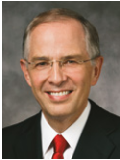
By Elder Neil L. Andersen Of the Quorum of the Twelve Apostles