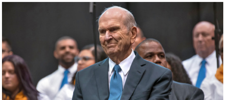
“By keeping God’s commandments,” President Nelson told Saints in Puerto Rico, “we can find joy even in the midst of our worst circumstances.”