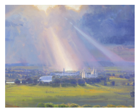
The light and spiritual power of God descend upon general conference.