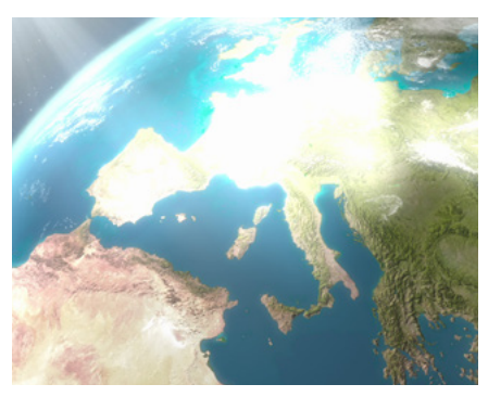
Power and light from general conference in turn move across the world.