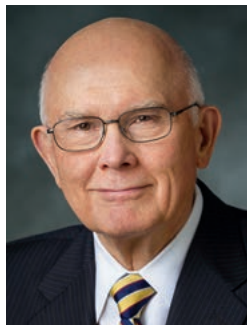
By Elder Dallin H. Oaks Of the Quorum of the Twelve Apostles