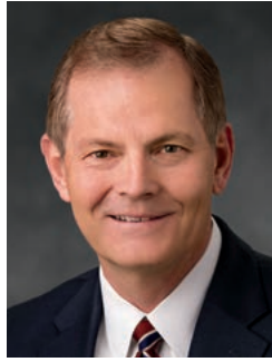
By Elder Gary E. Stevenson Of the Quorum of the Twelve Apostles