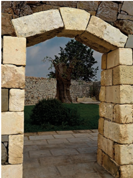
The Book of Mormon, like a keystone in an arched gateway, can become the keystone of our testimony.

very center and at the highest point of an arch. It is the most important of the stones because it keeps the sides of the arch in place, preventing collapse. And it is the structural element that ensures the gate, or opening below, is passable.