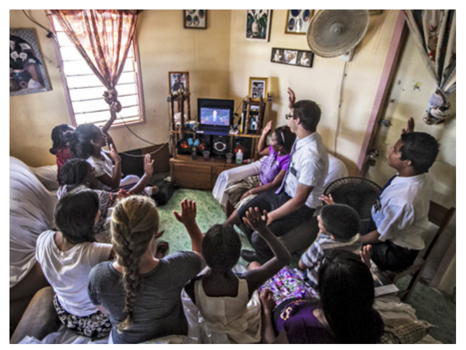
San Pedro, Belize

receiving a remission of our sins and that are associated with keeping the Sabbath day holy?