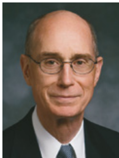
By President Henry B. Eyring First Counselor in the First Presidency

Scan this QR code or visit lds.org/go/Oct14Conf10 to watch this talk or to find a shareable video highlight and picture quote.