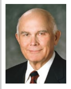
By Elder Dallin H. Oaks Of the Quorum of the Twelve Apostles