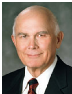
By Elder Dallin H. Oaks Of the Quorum of the Twelve Apostles