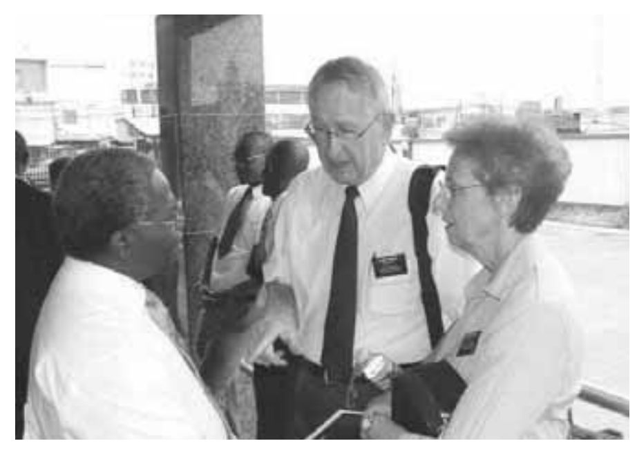
A missionary couple shares a message in Nigeria.

Some of those converts and their children have also served missions.