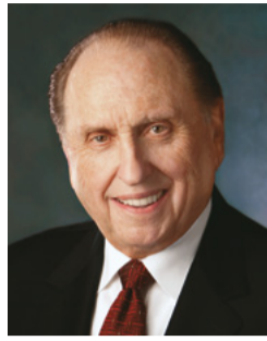
Thomas S. Monson President