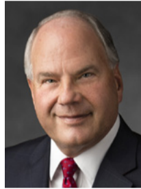
Ronald A. Rasband