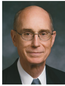
Henry B. Eyring First Counselor