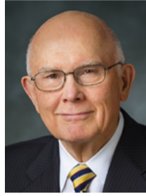
Dallin H. Oaks