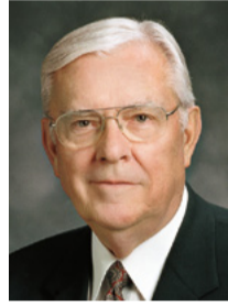
M. Russell Ballard