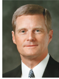
David A. Bednar