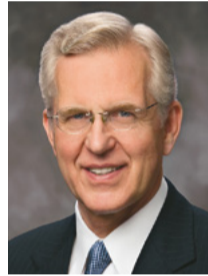
D. Todd Christofferson