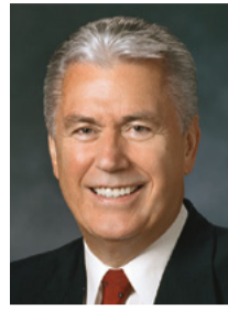
Dieter F. Uchtdorf Second Counselor