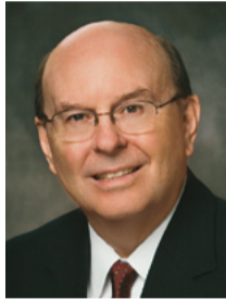
Quentin L. Cook