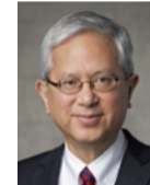
Gerrit W. Gong