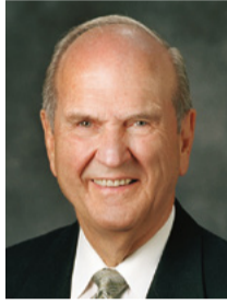
Russell M. Nelson