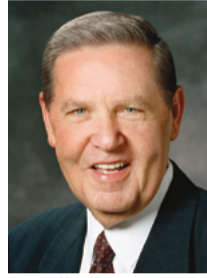
Jeffrey R. Holland