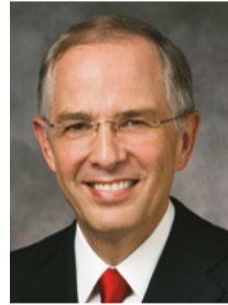
Neil L. Andersen