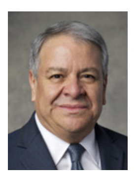
By Elder Benjamín De Hoyos Of the Seventy