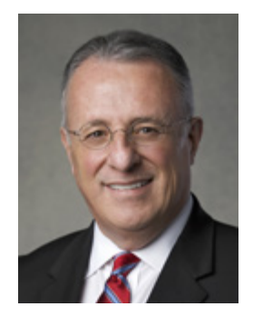
By Elder Ulisses Soares Of the Presidency of the Seventy