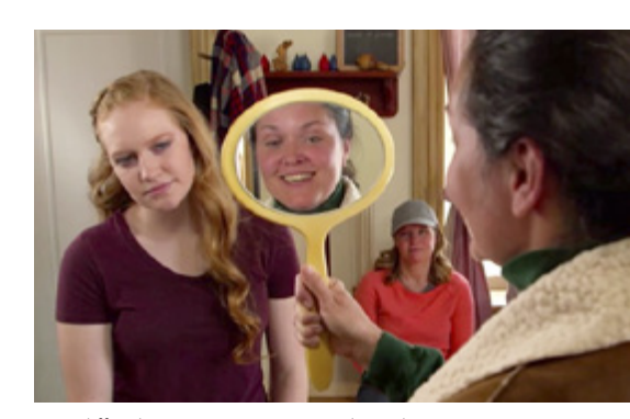
It is difficult to communicate with and serve others if we see only ourselves and our needs.

to talk with the young woman. Not surprisingly, it didn't even begin to be an effective or heartfelt conversation. This was a powerful object lesson that illustrated how difficult it is to communicate with and serve others if we are too worried about ourselves and see only ourselves and our needs. [She] then put away the mirror, pulled out a window frame, and put it between her face and the young woman's face. . . . We were able to see that the young woman had become [her] focal point and that true service requires that we focus on the needs and emotions of others. Ofttimes we are so worried about ourselves and our own busy lives—as we look in mirrors while trying to look for opportunities to