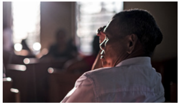
Pictured clockwise from top left are Church members and missionaries in McMinnville, Oregon, USA; San Martín de los Andes, Neuquén, Argentina; Johannesburg, South Africa; Helsinki, Finland; Natal, Rio Grande do Norte, Brazil; Ciudad del Carmen, Campeche, Mexico; Perpignan, France; Montreal, Quebec, Canada; London, England.