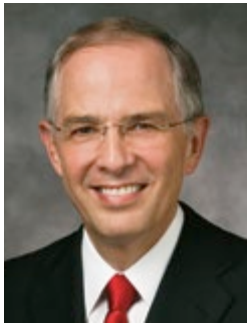
By Elder Neil L. Andersen Of the Quorum of the Twelve Apostles