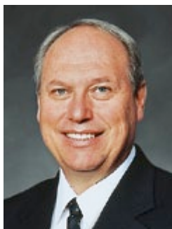
By Elder Christoffel Golden Jr. Of the Seventy

Scan this QR code or visit lds.org/go/Apr13Conf18 to watch or share a short video clip of this message.