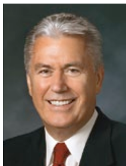
By President Dieter F. Uchtdorf Second Counselor in the First Presidency