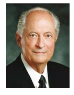
By Elder Robert D. Hales Of the Quorum of the Twelve Apostles