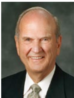
By Elder Russell M. Nelson Of the Quorum of the Twelve Apostles