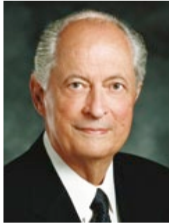
By Elder Robert D. Hales Of the Quorum of the Twelve Apostles