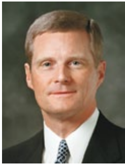
By Elder David A. Bednar Of the Quorum of the Twelve Apostles