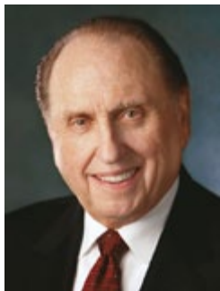
By President Thomas S. Monson

I declare my apostolic witness that the Father and the Son live. The spirit of revelation is real—and can and does function in our individual lives and in The Church of Jesus Christ of Latter-day Saints. I testify of these truths in the sacred name of the Lord Jesus Christ, amen. ■