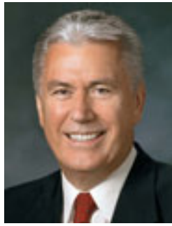
By President Dieter F. Uchtdorf Second Counselor in the First Presidency