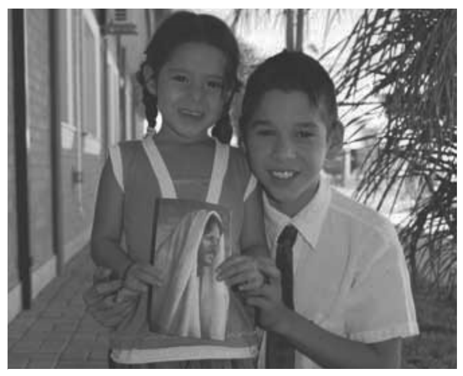
Children from the Bell Ville Argentina District show one of their favorite pictures.