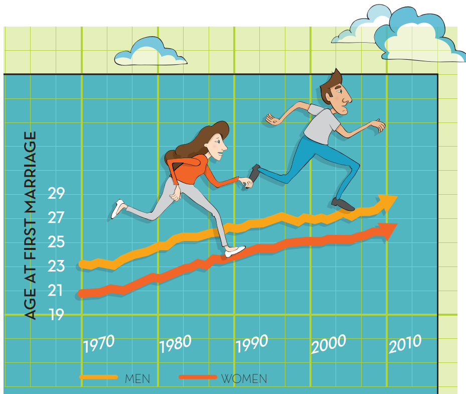
The age of marriage in the United States has been rising steadily since 1970, and in 1980 women passed the previous historical high, a benchmark reached by men 10 years later.

An expanded version of this material can be found at familyinamerica.org/journals/winter-2016/love-or-money/#.V6NlwusrJD8 . For additional information related to this article, see twenty-somethingmarriage.org .