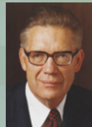
By Elder Bruce R. McConkie (1915–1985)

May I invite you to join with me in gaining a sound and sure knowledge of the Atonement.