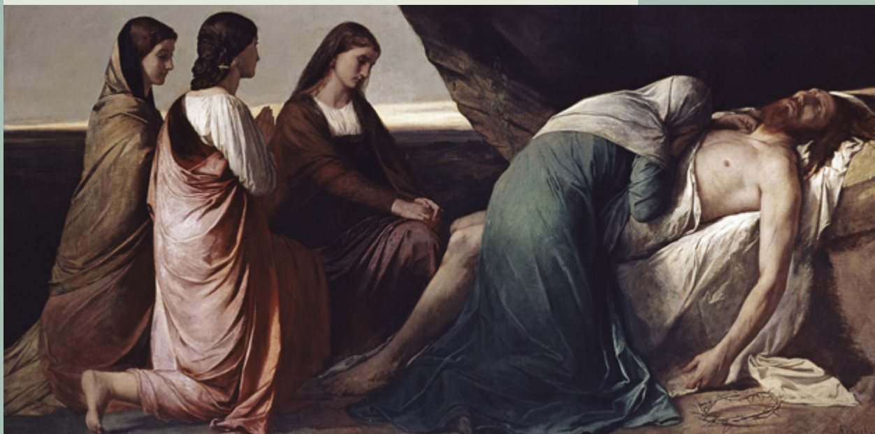
The body of Jesus Christ was laid in a tomb in a garden.

Then in Gethsemane we will see the Son of God ransom man from the temporal and spiritual death that came to us because of the Fall.