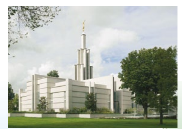
The Hague Netherlands Temple

dedicated The Hague Netherlands Temple, which serves five stakes and one district in the Netherlands, Belgium, and part of France.