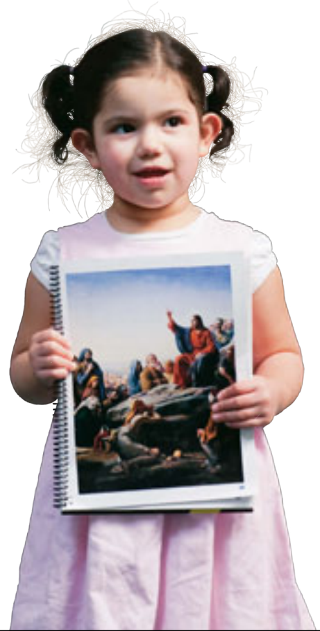
LEFT: PHOTO ILLUSTRATION BY CHRISTINA SMITH; PHOTOGRAPH BY JOHN LUKE; RIGHT: PHOTOGRAPH OF TEMPLE BY MATTHEW REIER; PHOTOGRAPH OF CHRISTUS BY MATTHEW REIER