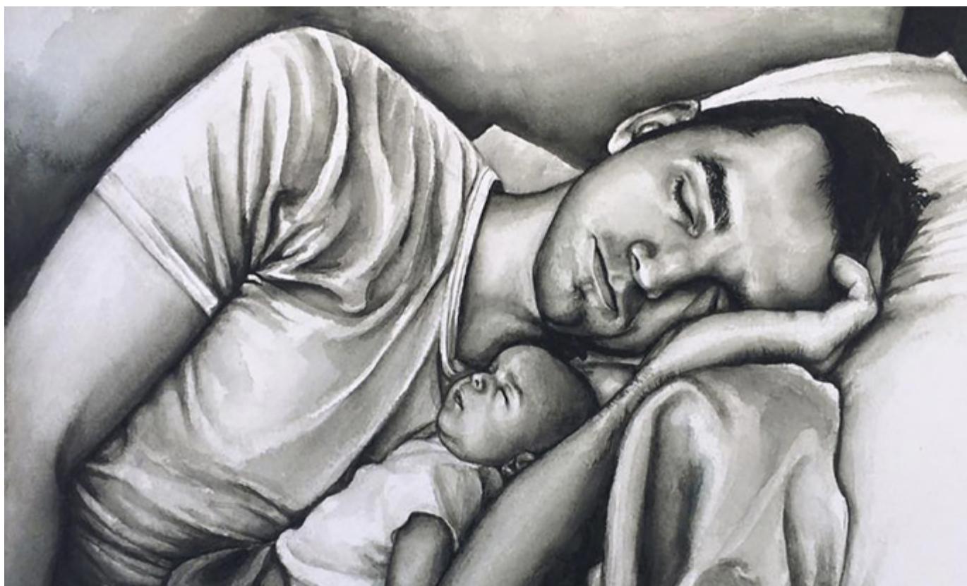
A watercolor painted by the author of her husband and daughter. She was inspired to pursue art by her home teacher—one of the father figures in her life.

father should be. I'm grateful he follows the examples set by prophets and apostles and that he chooses to cherish and love me unselfishly. His example as a loving husband also blesses our children. My heart is full of gratitude for his faithfulness through trials, his example of hard work, his worthiness to exercise the priesthood, and the pure, unwavering love he demonstrates as a young father.