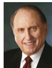
CHART YOUR COURSE, SET YOUR SAIL, AND PROCEED

I thought about the great adventures of our mortal lives when we decided to have a family. Each time one of our four children came into the world, it was like leaving the