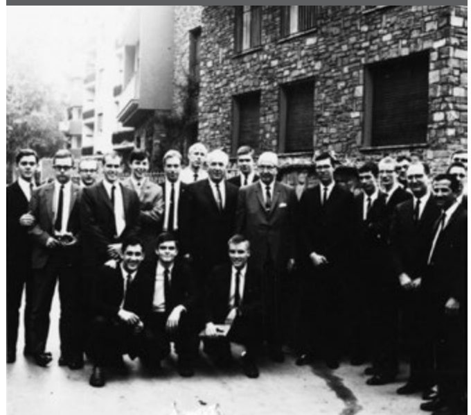
Elder Ezra Taft Benson (center) meets with missionaries of the newly formed Italian Mission.

In 1964, Italy was organized as a district of the Swiss Mission, and soon Italian-speaking missionaries were sent to several cities. In 1966, the Italian Mission was organized, 99 years after the original Italian Mission had closed. Elder Ezra Taft Benson (1899–1994) of the Quorum of the