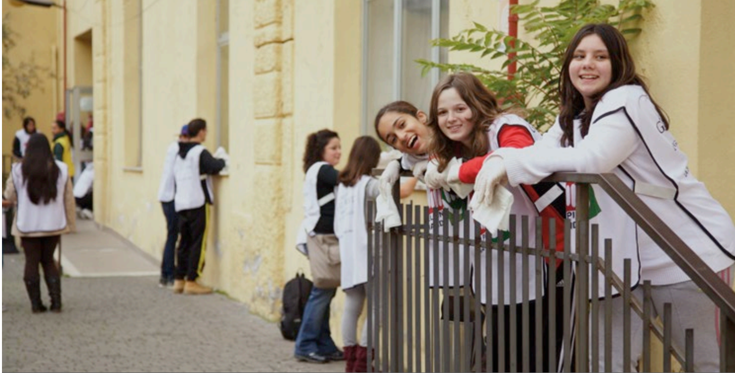
Youth of the Rome Italy East Stake help clean and paint a homeless shelter.