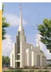
◀ 2008: The Rome Italy Temple announced by President Thomas S. Monson