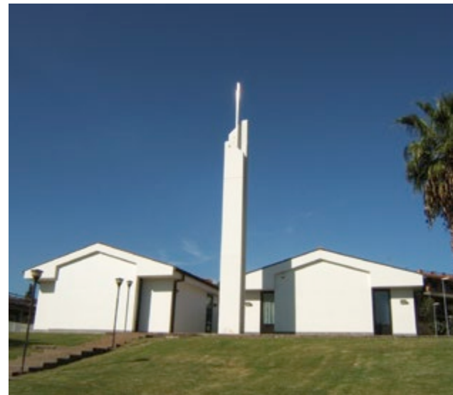
The meetinghouse of the Catania Ward on the coast of Sicily. The Catania Branch was formed in 1967, a year after the Italian Mission was organized.