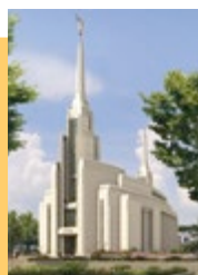
◀ 2008: The Rome Italy Temple announced by President Thomas S. Monson