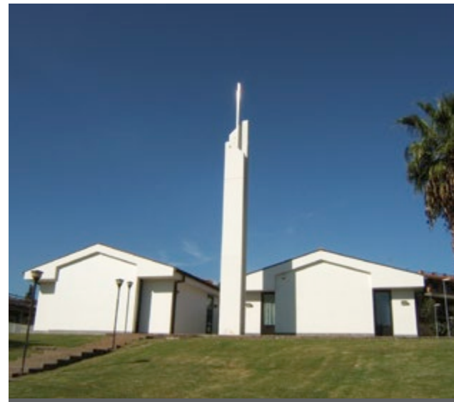
The meetinghouse of the Catania Ward on the coast of Sicily. The Catania Branch was formed in 1967, a year after the Italian Mission was organized.