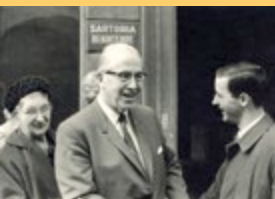
1972: President Harold B. Lee visits members in Italy, the first Church President to visit in latter days