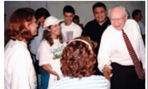
President Gordon B. Hinckley visited Church members in Honduras following the hurricane in 1998.

But how can you ask someone so destitute to sacrifice? President Hinckley knew that the food and clothing shipments they received would help them survive the crisis, but his concern and love for them went far beyond that. As important as humanitarian aid is, he knew that the most important assistance