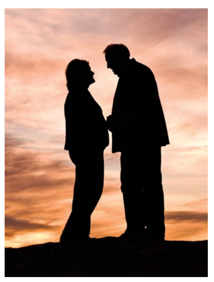
Great happiness has come into our lives because we are united in the gospel.

What made the difference in me? The Holy Spirit and a knowledge of the scriptures. Both gave me the courage to change my life and to ask God for forgiveness of my sins, which were what had really kept me from joining the Church all those years.