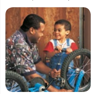
1. Parents have a sacred duty to care for their children (see D&C 83).