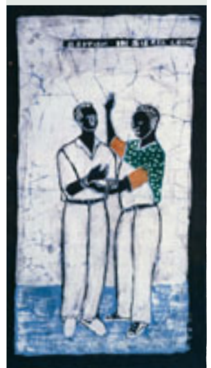
TOP: PHOTOGRAPH OF NIGERIAN BAPTISMS IN 1978 BY JANATH CANNON; ABOVE: ORDINATION IN SIERRA LEONE BY LATTER-DAY SAINTS, BY EMILE WILSON; RIGHT: BAPTISM IN SIERRA LEONE, BY EMILE WILSON