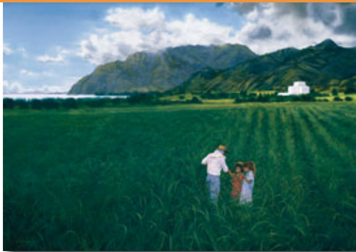
LEFT: PHOTOGRAPH OF 1882 MEETINGHOUSE; ABOVE: THE PROMISE , BY AL ROUNDS; BELOW LEFT: BUILDING NOW FOR ETERNITY , BY SYLVIA HUEGE DE SERVILLE, FOURTH INTERNATIONAL ART COMPETITION; BELOW: LEHI'S DREAM , BY ARACELI ANDRADE, SEVENTH INTERNATIONAL ART COMPETITION

He and all latter-day prophets since the Restoration of the gospel know that these words written by the Prophet Joseph Smith in March 1842 are true: “The Standard of Truth has been erected; no unhallowed hand can stop the work from progressing; persecutions may rage, mobs may combine, armies may assemble, calumny may defame, but the truth of God will go forth boldly, nobly, and independent, till it has penetrated every continent, visited every clime, swept every