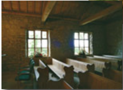
Left and above: The Gadfield Elm chapel in Malvern, England, is the first and oldest Latter-day Saint chapel. In 1840 Elder Wilford Woodruff converted the 600 members of the United Brethren who met here. They donated their chapel to the Church, and it became the focal point of missionary work in the area. Later they sold it to help pay for local members to gather to Zion.