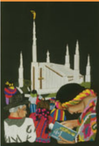
Left: The colors and textures of this embroidery capture the energy of the tremendous growth of the Church in Mexico, Central America, and South America over the past 50 years. These members love the Book of Mormon and are drawn to the temple, represented here by the Guatemala