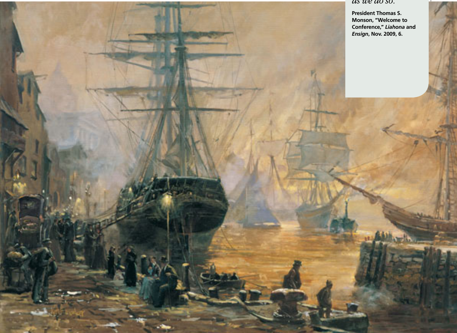
The ship Ellen Maria prepares to sail from Liverpool, England, for America on February 1, 1851. At the time, over 50,000 Latter-day Saints lived in the

President Thomas S. Monson, "Welcome to Conference," Liahona and Ensign , Nov. 2009, 6.