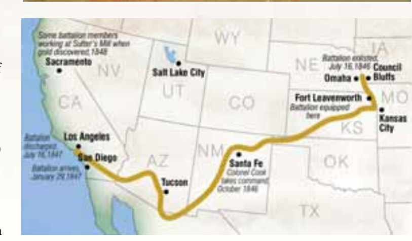
The Mormon Battalion made one of the longest treks in United States history—2,000 miles one way.

The story of the organization of the Mormon Battalion is a tender one. June of 1846 found 15,000 Latter-day Saints strung out across Iowa in a half dozen or more makeshift encampments. Forced to leave their comfortable homes in their own city, Nauvoo the Beautiful, they had endured a tragic exodus across Iowa. Many had died of starvation, exposure, and disease during the cold winter and wet springtime. They had no homes, no property, and no clothing except what they carried in their wagons or wore upon