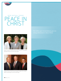
Message from the Young Women and Young Men General Presidencies