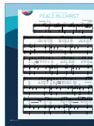
New song: “Peace in Christ”