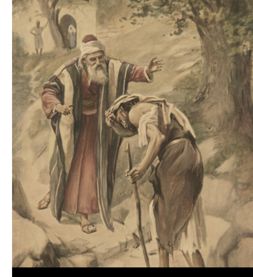
The parable of the prodigal son stands as one of the greatest stories of God's love and compassion for His children.

Taking this parable to heart, parents must strive to remain unwavering in their obedience to God's laws, despite any disappointment and worry about children.