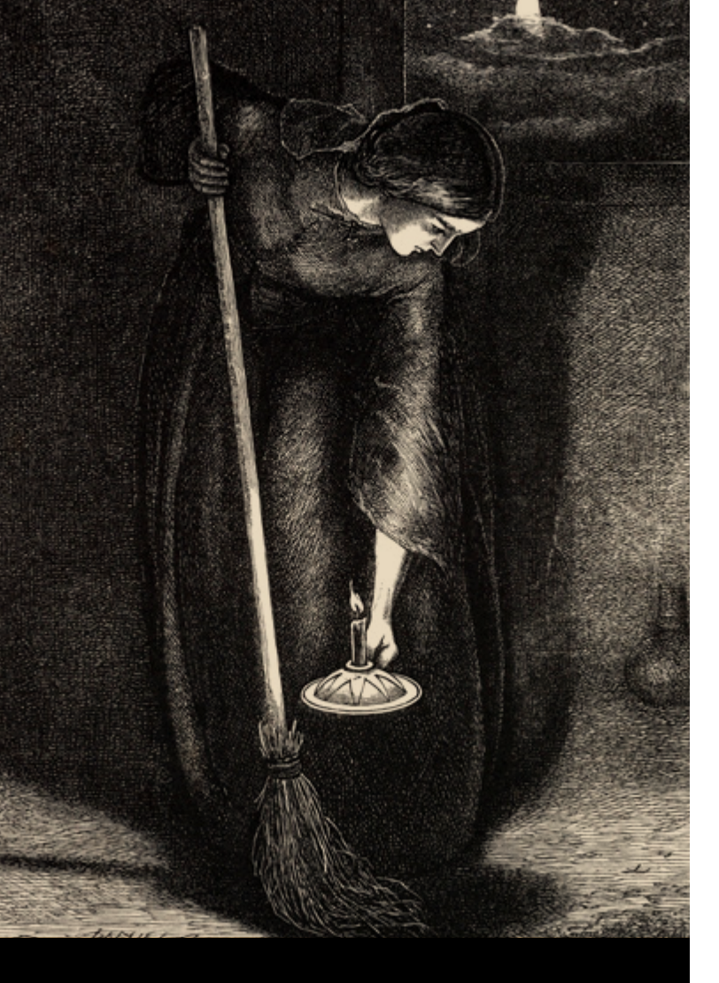
For today's families it may be necessary for some parents to look inwardly at their own lives as they try to rescue a lost family member.