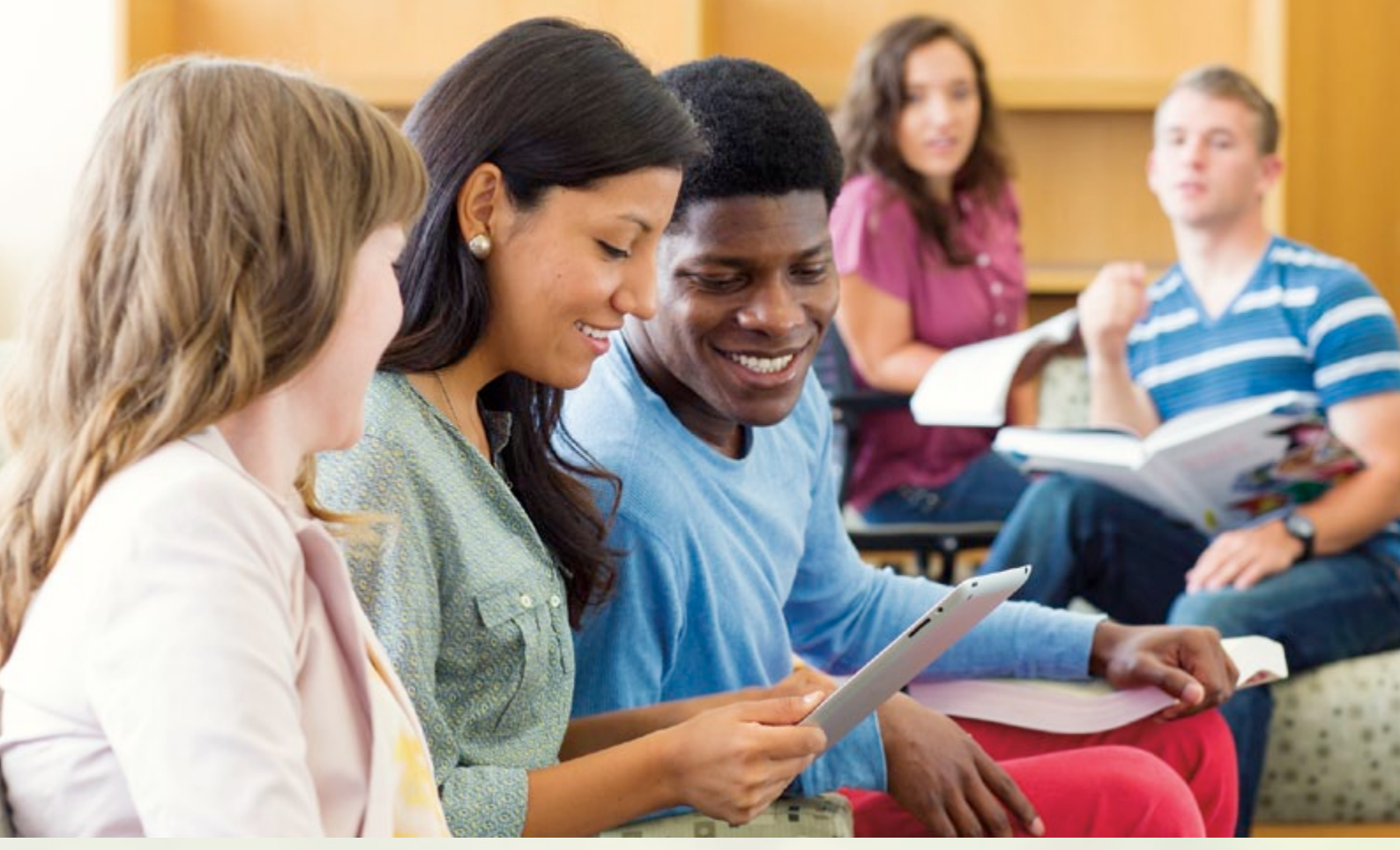
Many new discoveries will be made to help bring to pass the purposes and work of God and to quicken, including through missionary work, the building of His kingdom on earth today.

will be built to bless the Saints, as has been prophesied regarding premillennial growth of the Church.