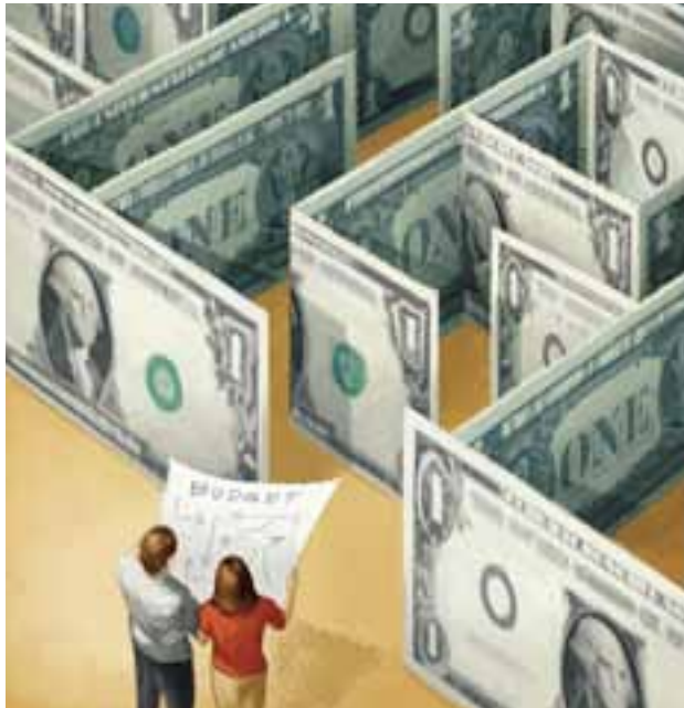
As we document our expenditures, we can see where our money is going and increase our awareness of how we spend discretionary income.

Consider major purchases for a few days before making any commitment. Be certain that they are wise and appropriate for you and your family and that you can afford them. Also consider other ways of obtaining what you need. Rentals or shared items sometimes work just as well as new, higher priced items and can save a lot of money.