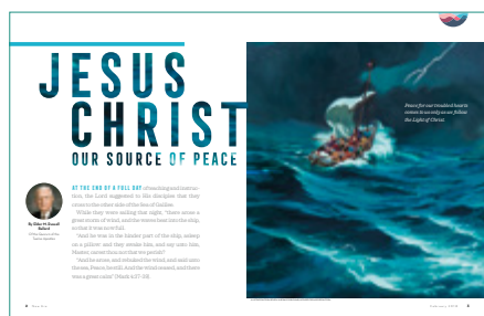
A message from Elder M. Russell Ballard of the Quorum of the Twelve Apostles discussing the kind of inner peace we can find only through the Savior (page 2).

Two articles in this month's New Era aim to help youth know how to find true and lasting peace in a world of turmoil: