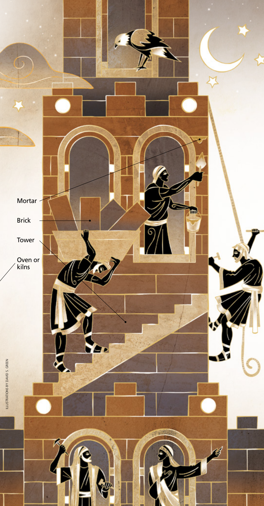
ILLUSTRATIONS BY DAVID S. GREEN