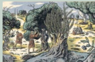
Lehi (Nephites and Lamanites)

Jacob 5:3-14 (to be continued in part 2)