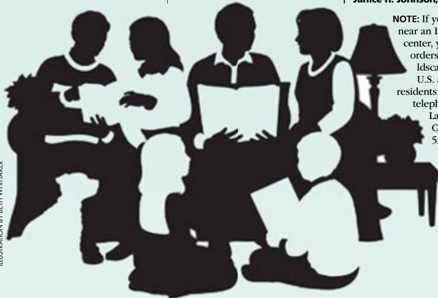
ILLUSTRATION BY BETH WHITTAKER

NOTE: If you do not live near an LDS distribution center, you can place orders online at ldscatalog.com . U.S. and Canada residents may also telephone the Salt Lake Distribution Center at 1-800-537-5971.