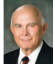
By Elder Dallin H. Oaks Of the Quorum of the Twelve Apostles

From "Tithing," Ensign, May 1994, 33–34.