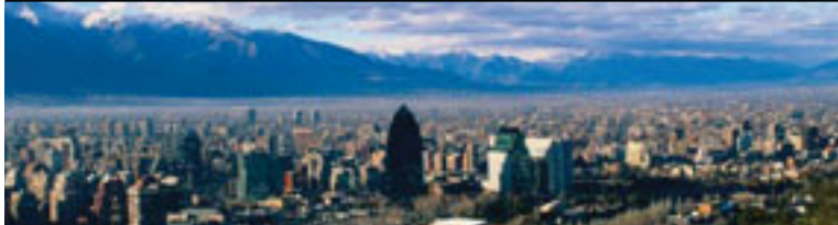
A view of Santiago, Chile's capital city.