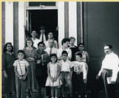
Members and missionaries in Costa Rica in 1956.

W ith the Caribbean Sea on the east and the Pacific Ocean hugging it on the west, Costa Rica is a country where the gospel flourishes from sea to sea. Test your knowledge of Costa Rica with the following quiz.