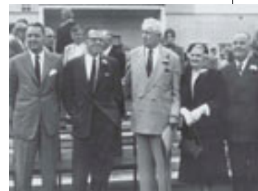
President David O. McKay (center) and other Church leaders at the dedication of the Bern Switzerland Temple in 1955.