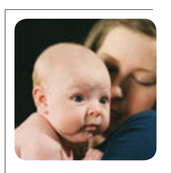
8. We chose to accept God's plan and follow Jesus Christ. We kept our first estate and progressed to our second estate, where we received a mortal body.